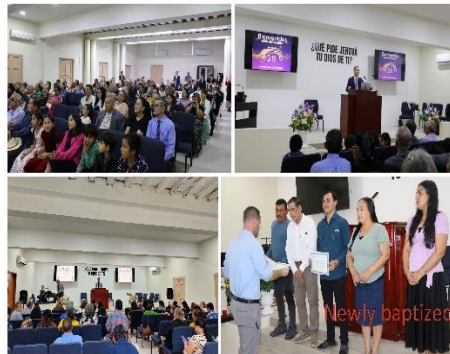
28 th Anniversary Service in Alhuey

We sincerely thank you for your prayers and faithful support!