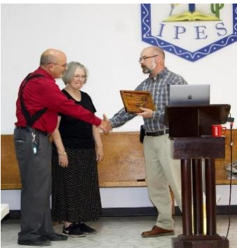
30 years with MGMI FB

Web Page South Asia FB Vimeo YouTube 1 YouTube 2 MGMI (FB) Donate