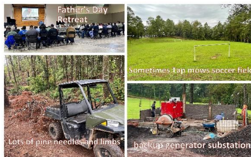
Location of Campamento Meta