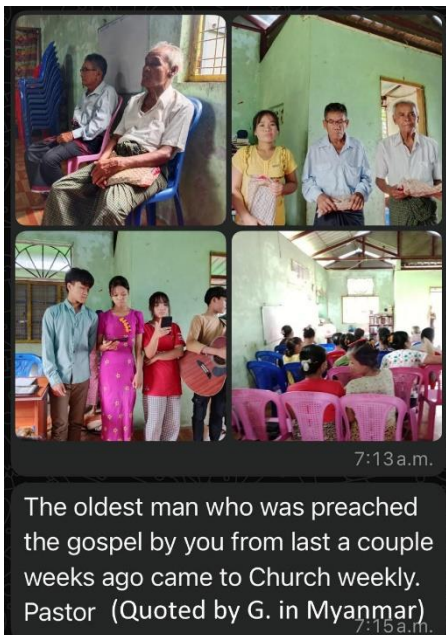
Buddhist family visiting in Myanmar ( Message )